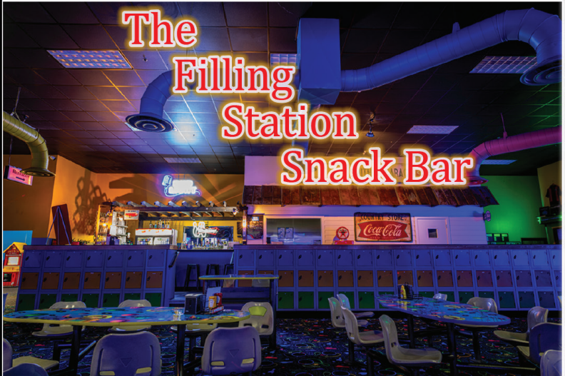
The Filling Station Snack Bar